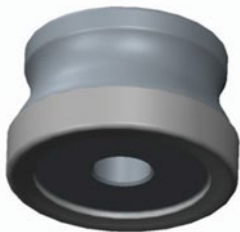
3D simple model (STEP) example